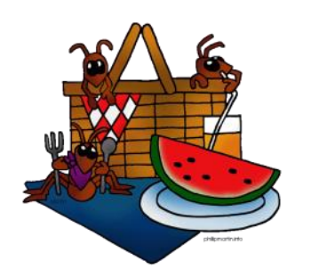
Community Meal Picnic, Wednesday, June 26 from 5-7 pm