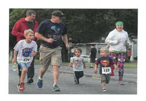
SPONSORSHIP DEADLINE JULY 1