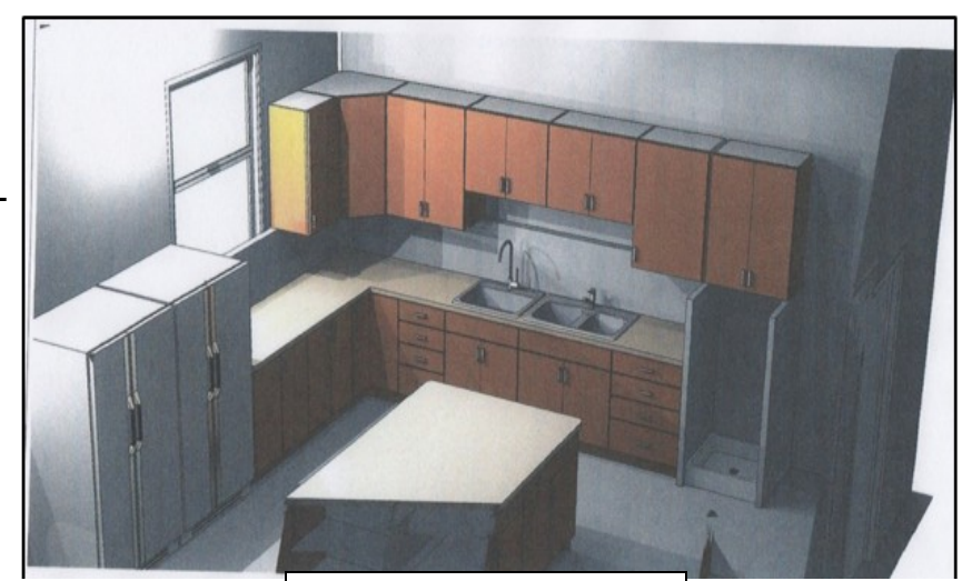
Facing the west wall.

Colors and finishes have not been determined. Those represented in the sketch were computer generated.