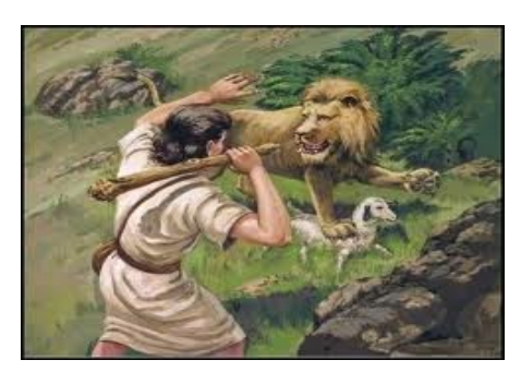
David vs Lion

than dwelling on what we don't have. God has given us enough to bless people here and around the world.