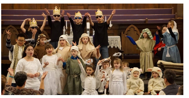
2017 Christmas Program

Children's Program in the sanctuary following the meal.