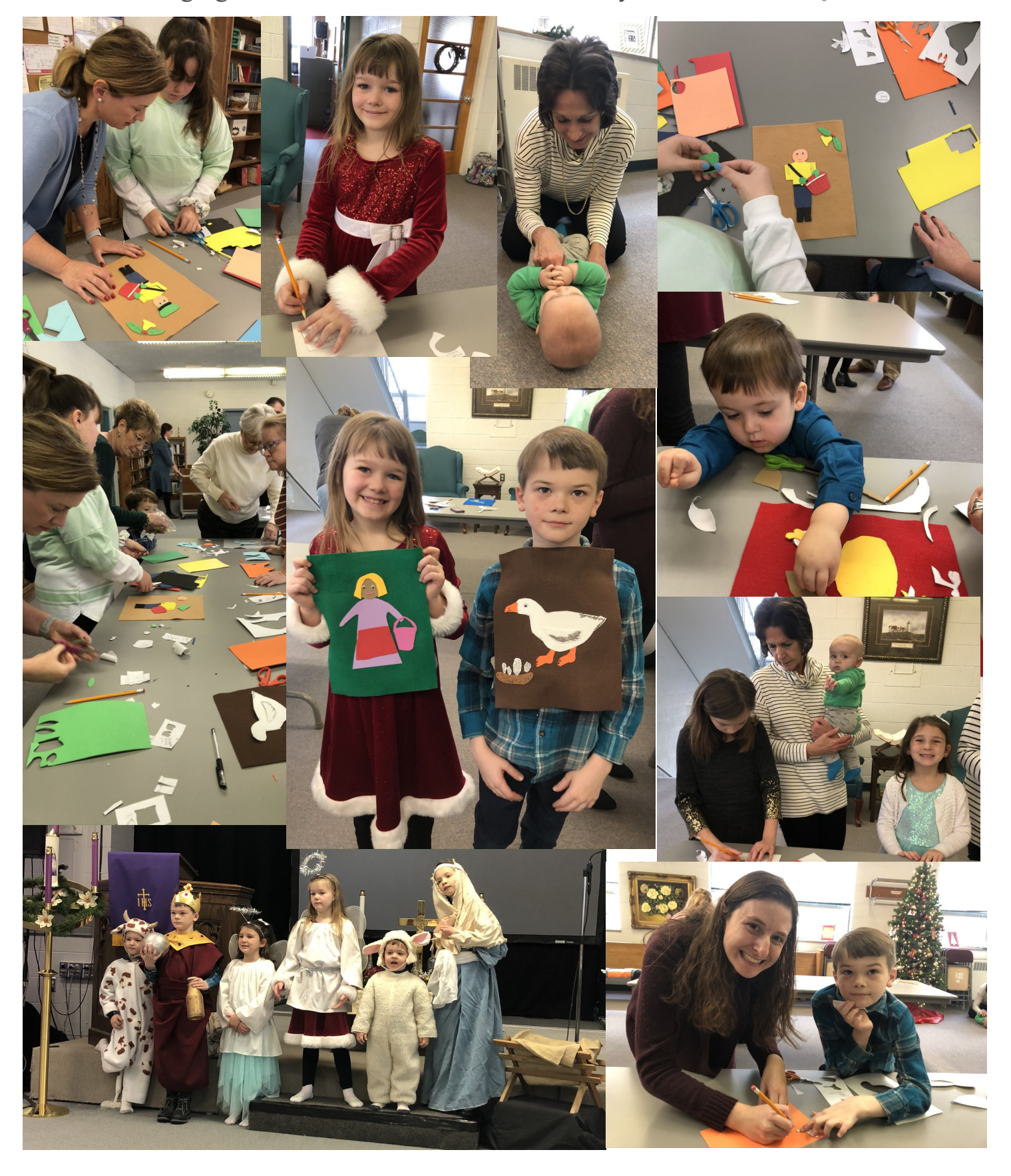
"Bringing In Christmas" and "The Twelve Days of Christmas" Quilt