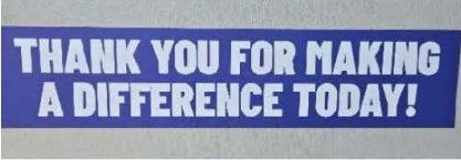
Sign we saw every day as we left the work space.